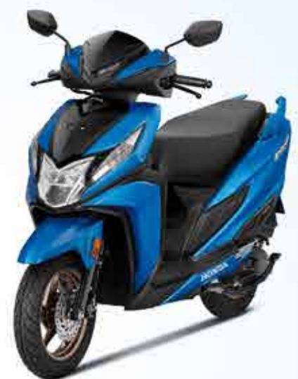
MAT MARVEL BLUE METALLIC