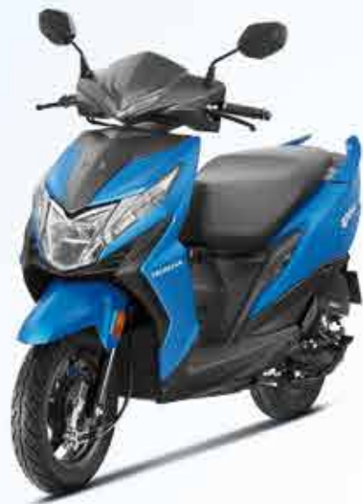
MAT MARVEL BLUE