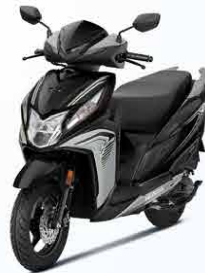
PEARL DEEP GROUND GRAY (STRIPE)