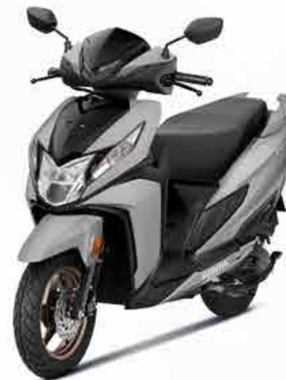
PEARL DEEP GROUND GRAY (EMBLEM)