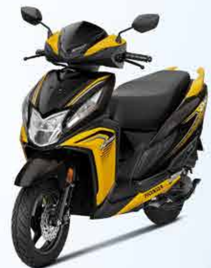
PEARL SPORTS YELLOW